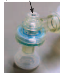
pressure relief valve

Preventing lung damage is a paramount concern for anyone performing resuscitations. A pressure relief valve is designed to limit the pressure that the resuscitator can deliver. All bag and mask resuscitator models tested had a relief valve except the Blue Cross resuscitator. Note: Many of the models evaluated lacked any indication regarding the position of the valve—enabling the user to disable the relief valve without their knowledge.