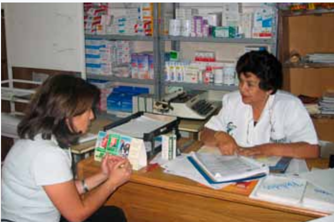
A Bolivian technical advisor visits Nicaragua to share her supply chain management expertise and explore ways the two countries can learn from one another to strengthen contraceptive security.

In 2009, the Regional Initiative, in collaboration with UNFPA, brought together key staff from nine countries to learn from each other’s successes and challenges. They used the regional research findings to think strategically about how to further improve procurement in each of their countries. Then, those