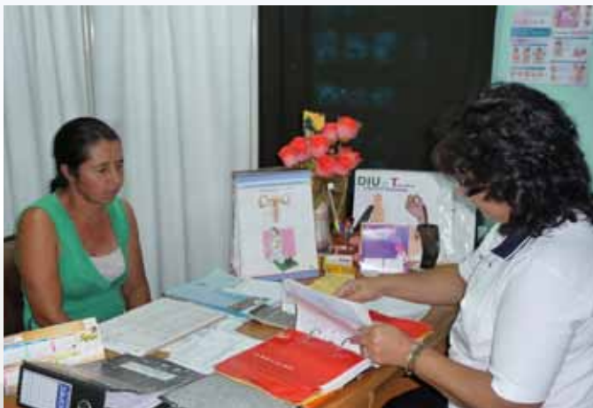
Woman receiving family planning services in Paraguay.

The Regional Initiative's highly interactive and participatory approach has shown that, by sharing challenges, solutions, and successes, country representatives are inspired to return home and develop customized CS strategies that work.