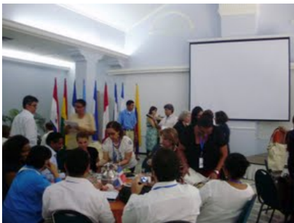
USAID | DELIVER PROJECT 2009

Work group discussing procurement mechanisms during the Developing Alternatives for the Acquisition of Contraceptive Supplies in Latin America and the Caribbean regional workshop (Cartagena de Indias, Colombia, September 2009).