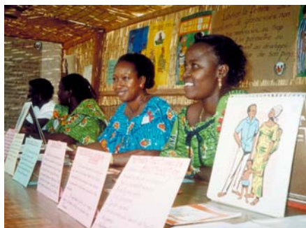
A family planning booth at a health fair in Burkina Faso.