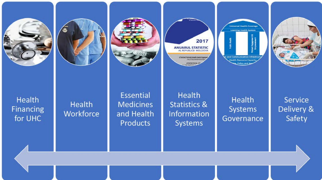
Fig. 1. The building blocks of UHC