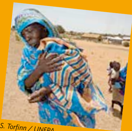
S. Torfinn / UNFPA

A mother in Darfur, Sudan. In conflict or post-conflict situations, countries can face severe shortages of contraceptives and medical supplies. Seventeen countries most in need gained life-saving assistance when the European Commission, in a partnership agreement with the African, Caribbean and Pacific Group of States (ACP), contributed nearly €15 million to help UNFPA provide equipment and supplies for obstetric and maternal health. The programme used a highly participatory approach that set out to reduce shortfalls and improve access, use, distribution and procurement, as well as to build governments' capacity to plan and manage their reproductive health commodity supply systems.