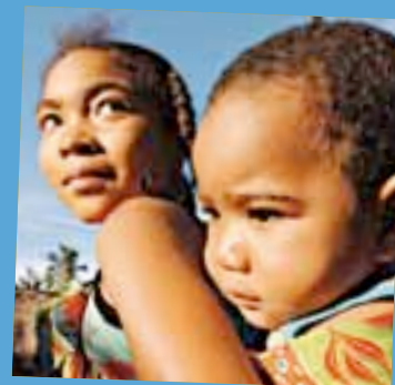
K. Opprann / UNFPA