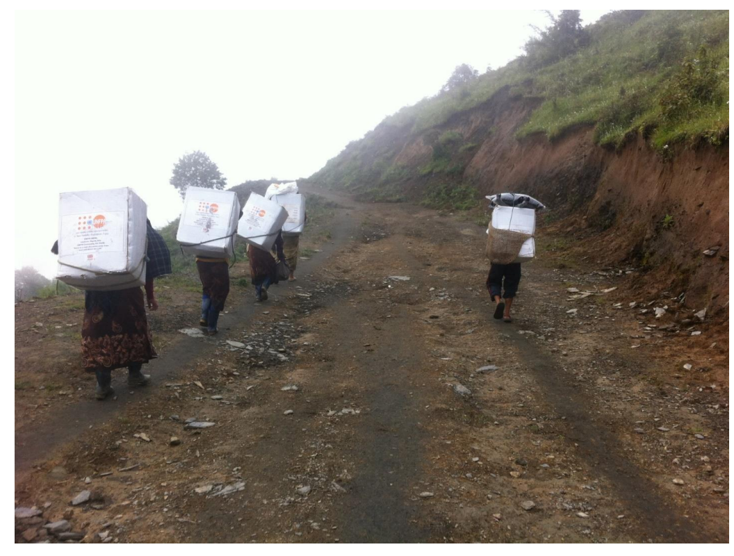
CARE Nepal, Delivering RH Kits