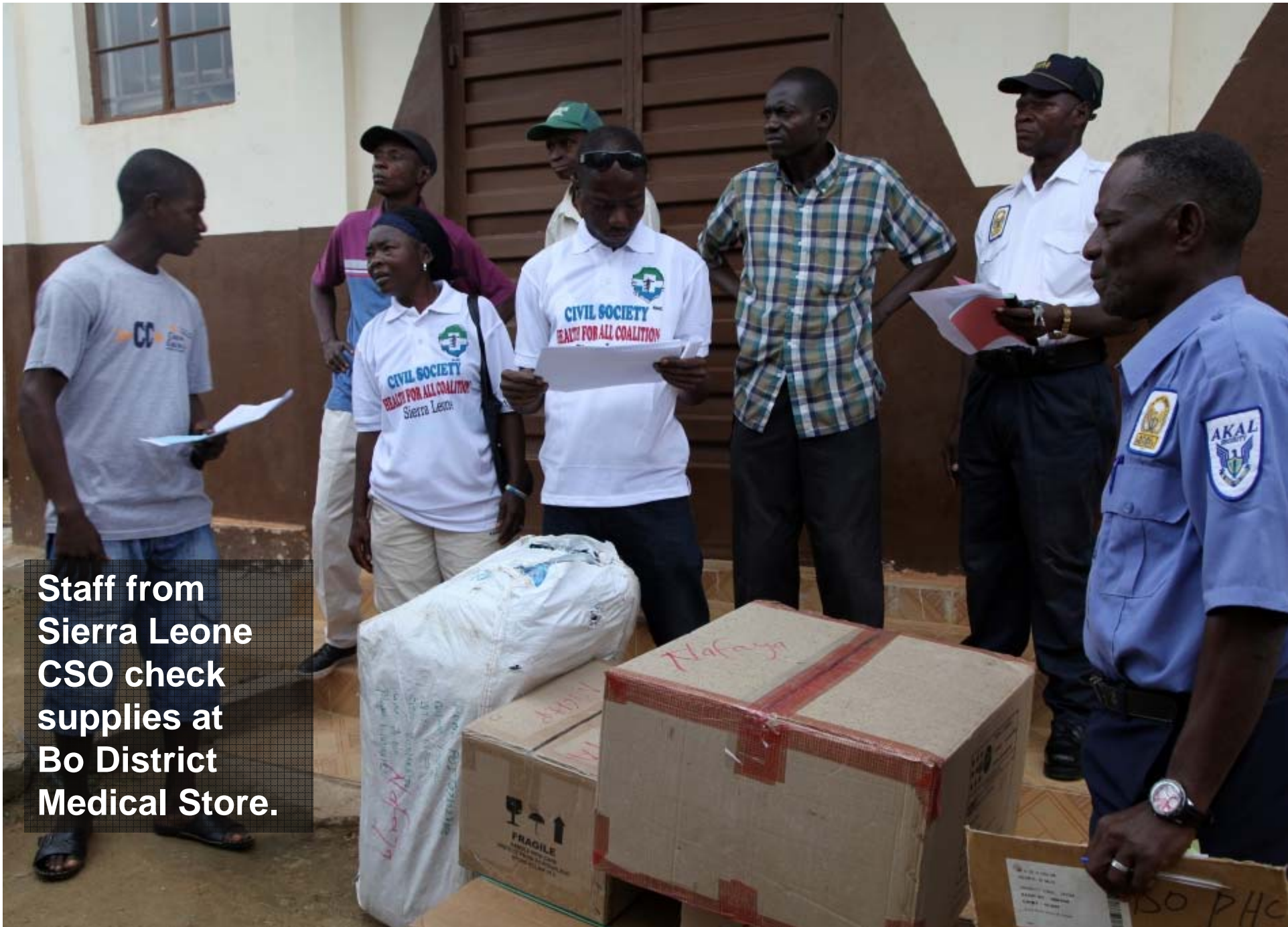
Staff from Sierra Leone CSO check supplies at Bo District Medical Store.