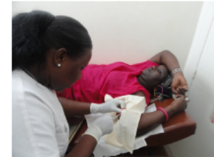
A woman receives a contraceptive implant, which is inserted into the upper arm, at a health facility in Senegal.

Contraceptives are an important and cost-effective component of good maternal health care, supporting safe pregnancy, labor, and childbirth. Yet, an estimated