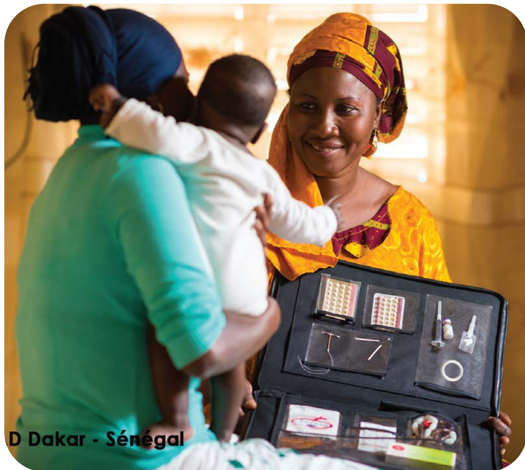
D Dakar - Sénégal